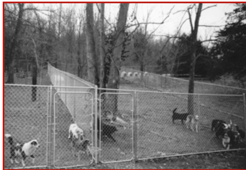
A view of some of the C.A.R.E. Sanctuary yards for large dogs

Despite our best efforts this year, adoptions have been slow. Even so, we have rescued and adopted out over 500 animals as of October. Each one individual and deserving of the love and happiness that now lies ahead.