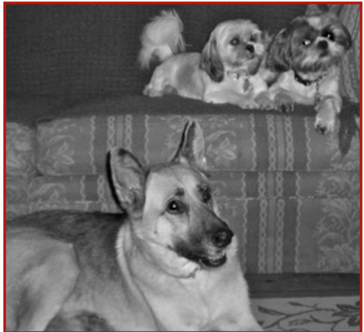
Abby, Patsy, and Max palling around in their forever home.