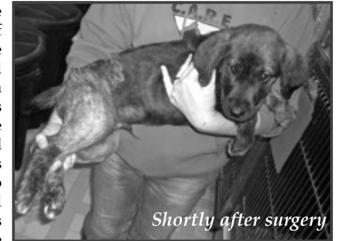
Shortly after surgery