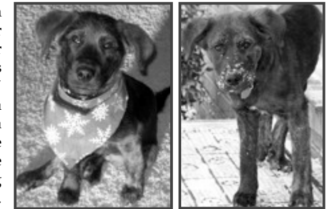
Healing in foster care. Snow play time!